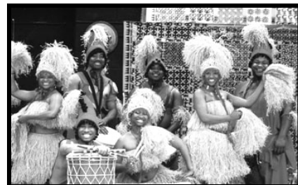
The Magic of African Rhythm

treated to the music of the Bay Street Brassworks quintet. Our 3 rd and 4 th graders learned new ways to think about writing poetry with their Writers in Residence.