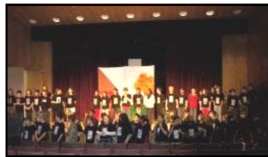
The opera was written, produced and performed in its entirety by 5th graders.